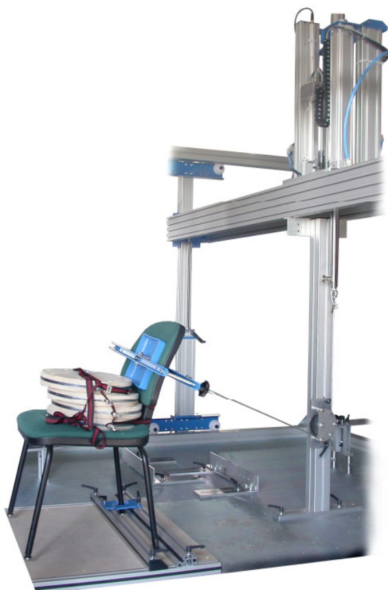
Installation set tilting and drop test for universal test fields order no.: 40-910-081