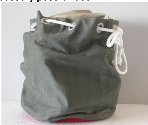
Weight bag for tilting and drop test order no.: 40-910-086