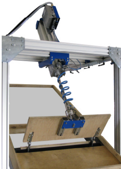
Test on bed fitting