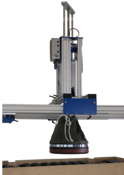
Drop test on bed frame