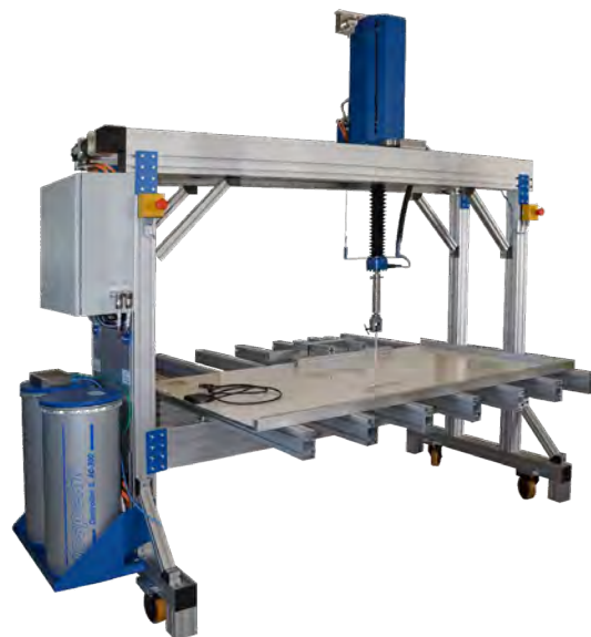
Test rig for 90° peel tests on solar modules (10-012-050)