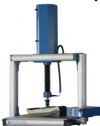
Single-spindle special testing machine inspekt S 5 kN (10-012-907)