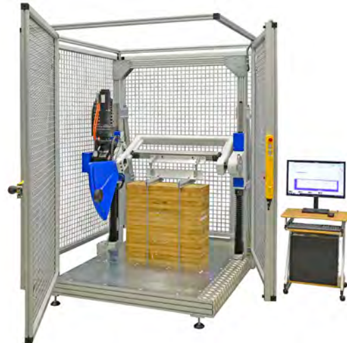
Test rig for fitting tests on hinges and flap mechanisms (41-041-425)