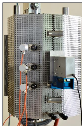
Fig.: Fixation at the high temperature furnace