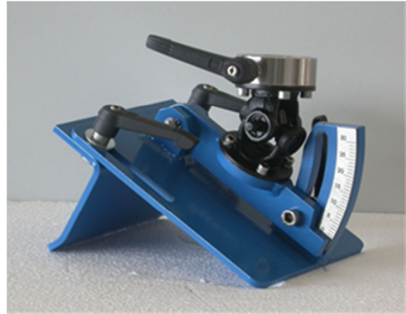
Arm rest load pads Order no.: 41-006-516